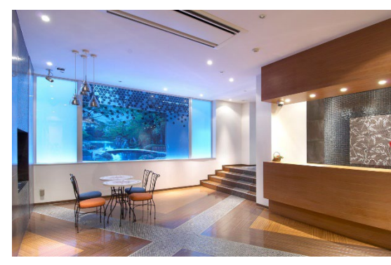
Interior (An example within a residence)